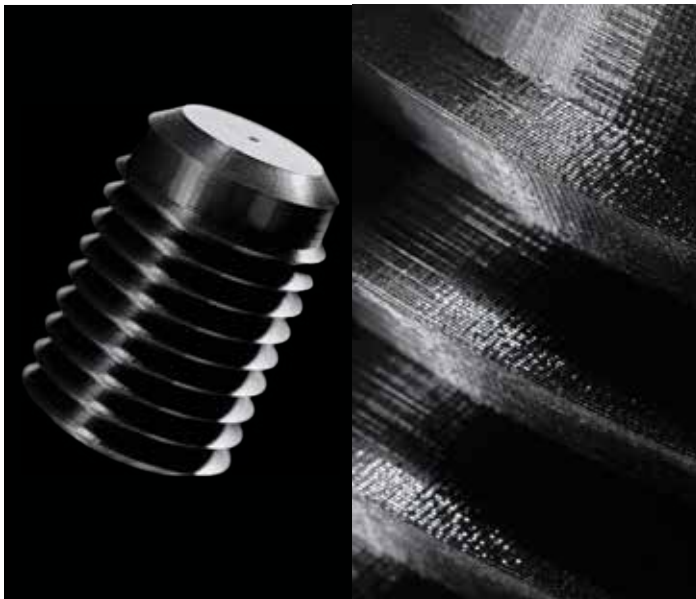
S-TPU in Black