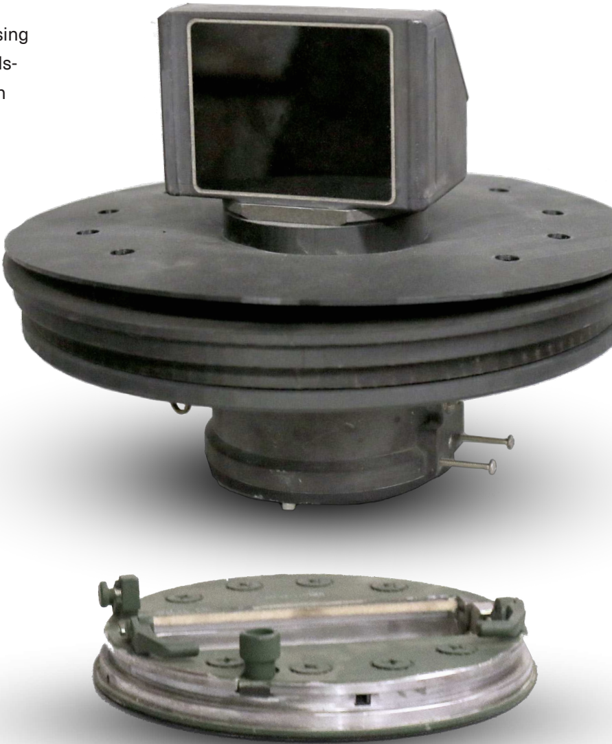
Pictured: the hatch plug with 3D printed components

. . . . . . . . . . . . . . . . . . . . . . . . . . . . . . . . . . . . . . . . . . . . . . . . . . . . . . . . . . . . . . . . . . . . . . . . . . .