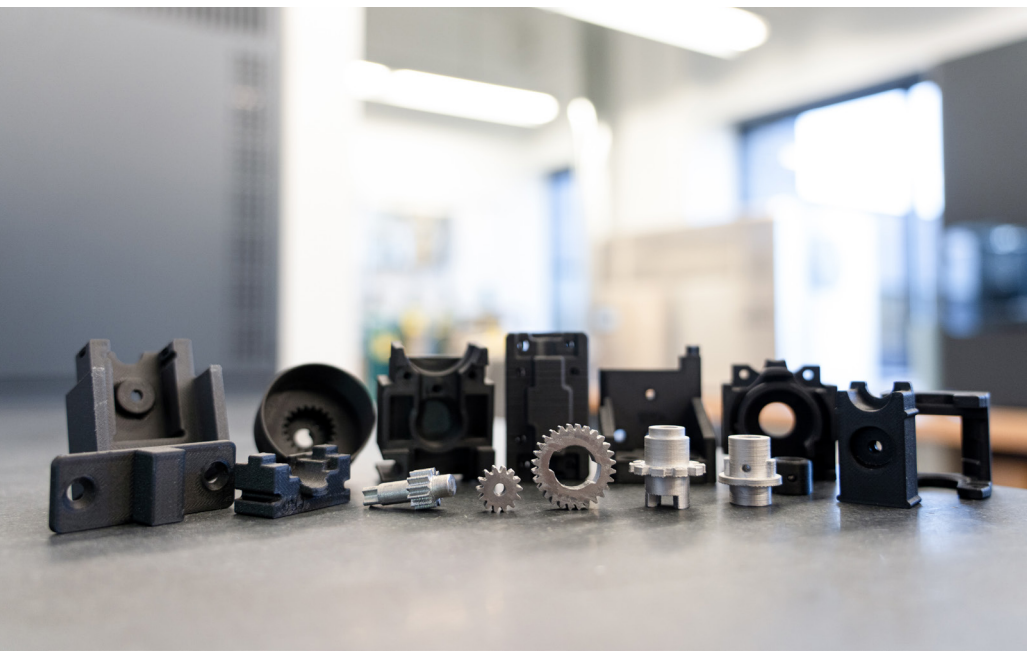
3D printed metal and carbon fiber components for R&D testing.