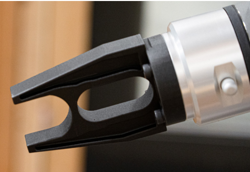
The company has printed end effectors for their robots to conduct numerous tests