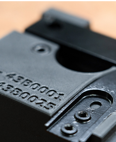
Custom assembly fixture